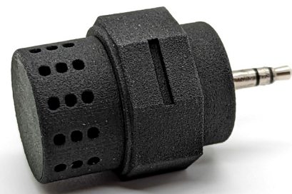
Sonicu incubator monitoring sensor