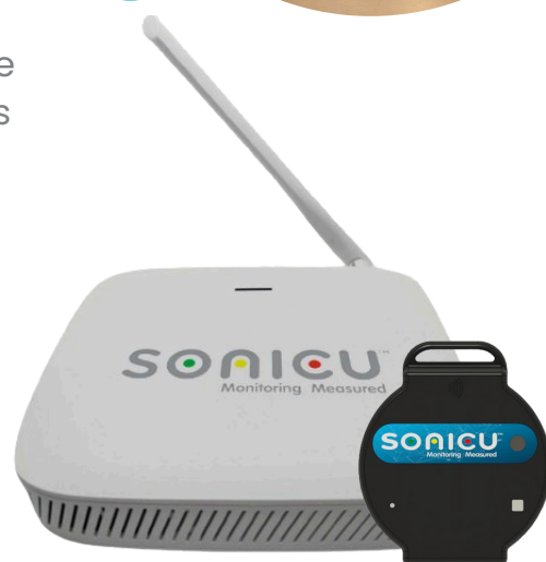
SoniLink Hub and the Sonicu S-Series Sensor